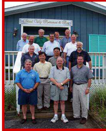
Yogi Berra once said, "It ain't over until it's over!"

Your company will benefit most if you attend as part of a 3 - 4 person company team. Your team will work together and return to your organization with the foundation built for completing the ACE Team Process and have in place a completed process for estimating maintenance type work. There will be scheduled practical exercises with facilitation support from MEI staff. The workshop "is definitely not over when it's over".